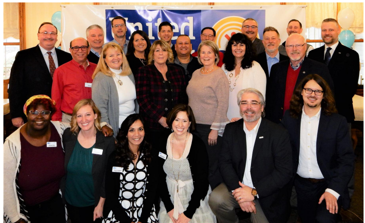
The new board and staff members celebrate the merger in Shipshewana.