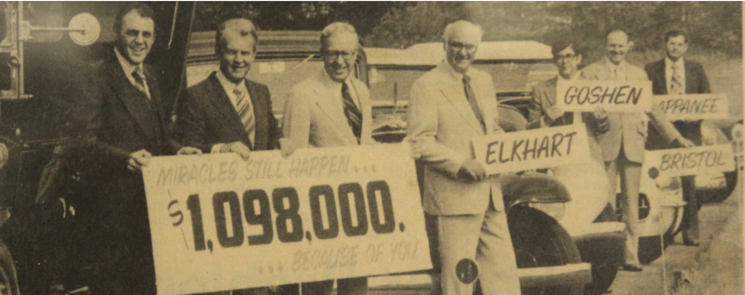
(1978 United Way Campaign)